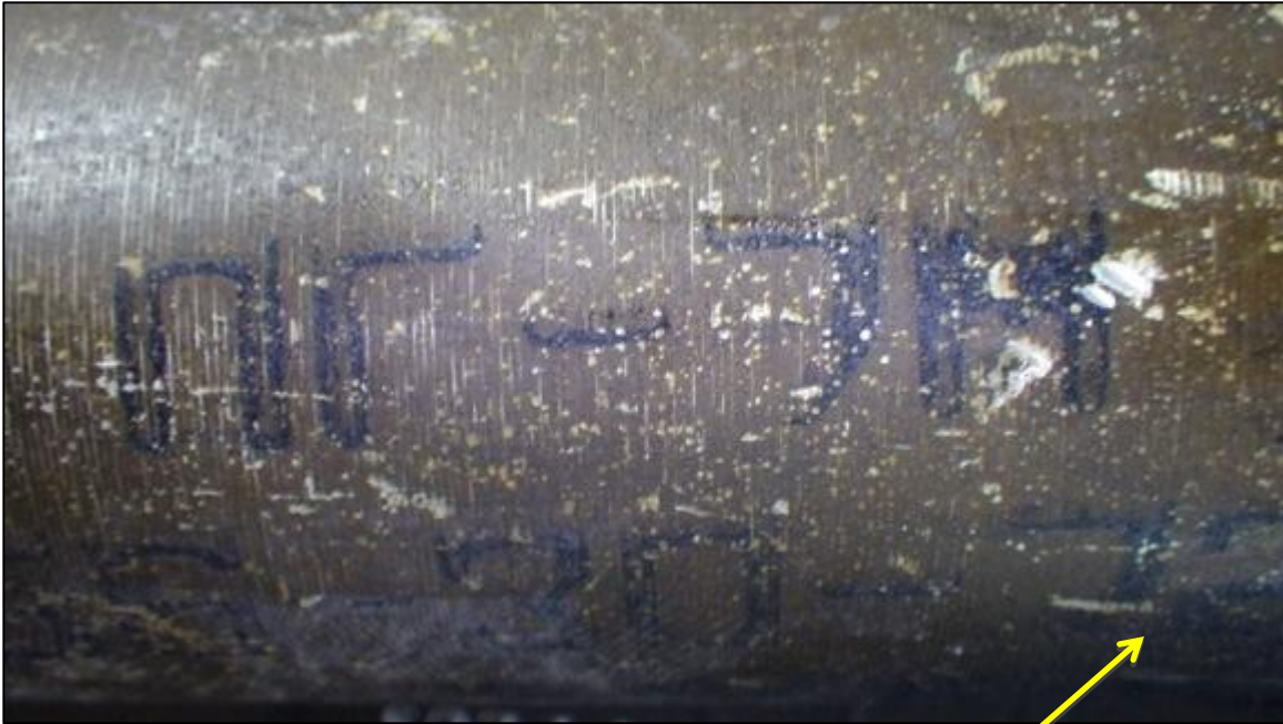
Rocket Anti tank PG7M (Bulgarie)