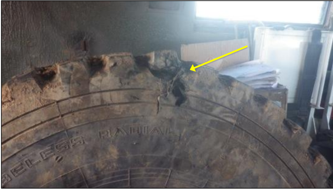
The shape charge has perforated the wheel, in first